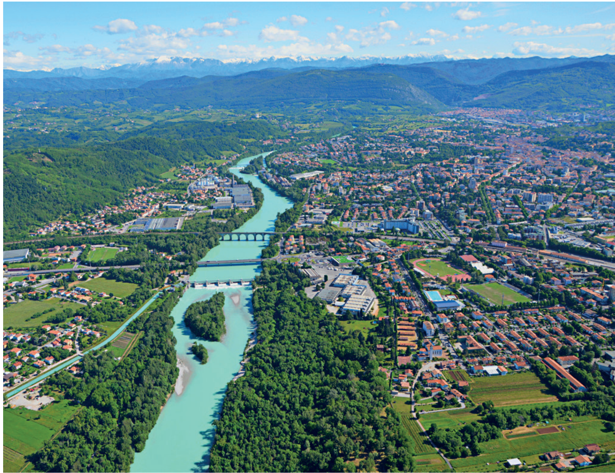
THE ISONZO RIVER AND THE CITIES - THE BORDER IS INVISIBLE

of European funding and the single cross-border commissioning body, thus concentrating some of the most innovative tools made available by Europe to support cross-border collaboration in a single entity. Among the projects of EGTC GO, funded by the Interreg VA Italy-Slovenia 2014-2020 Programme, we have the “Isonzo-Soča