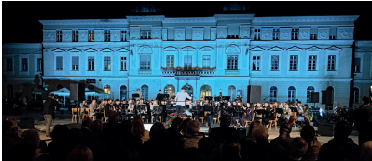
EVENT FOR THE SIGNING OF THE JOINT CANDIDACY OF NOVA GORICA AND GORIZIA AS EUROPEAN CAPITAL OF CULTURE 2025

◀ Cross-border Park”, which sees the creation of a common cross-border network of cycle and pedestrian paths along the Isonzo river and along the national border connecting Solkan to Šempeter-Vrtojba. The cycle path will run exactly on the border, where there was once a barrier. Other infrastructural works included in the project are the green area with parking spaces for campers in Vrtojba and a cycle/pedestrian bridge on the Isonzo river in Solkan. The Isonzo represents for Gorizia, Nova Gorica and Šempeter-Vrtojba a shared identity heritage and the ultimate goal of the project is precisely to “return” the river to the cities. Furthermore, the “Salute-Zdravstvo” project represents the first attempt to compare, analyse and search for synergies between the Italian and Slovenian social and health services and intends to improve their quality and the quality of life in the Municipalities of Gorizia, Nova Gorica and Šempeter- Vrtojba. In line with Directive 2011/24/EU on patient mobility and developing health-care in the European Union, the “Salute-Zdravstvo” project aims to encourage this mobility in five ar-